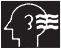
Hissing or Blowing Sound