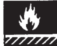
Fire emanating from the ground