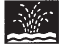
Water blowing into the air at standing water