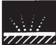
Dirt being blown into the air