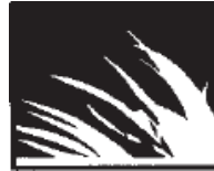
Dead or Brown Vegetation