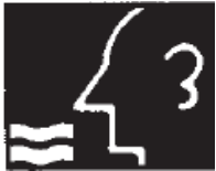
“Rotten egg” Odor